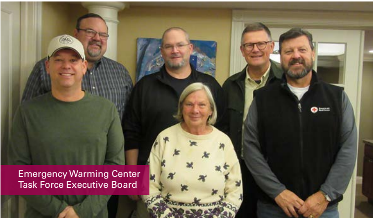
Emergency Warming Center Task Force Executive Board