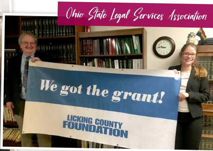
Ohio State Legal Services Association