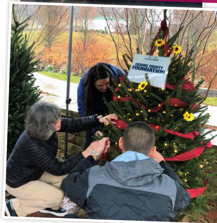
The Foundation team decorated a holiday tree for display at The Dawes Arboretum's Learning Center on a cold and raining day in December.