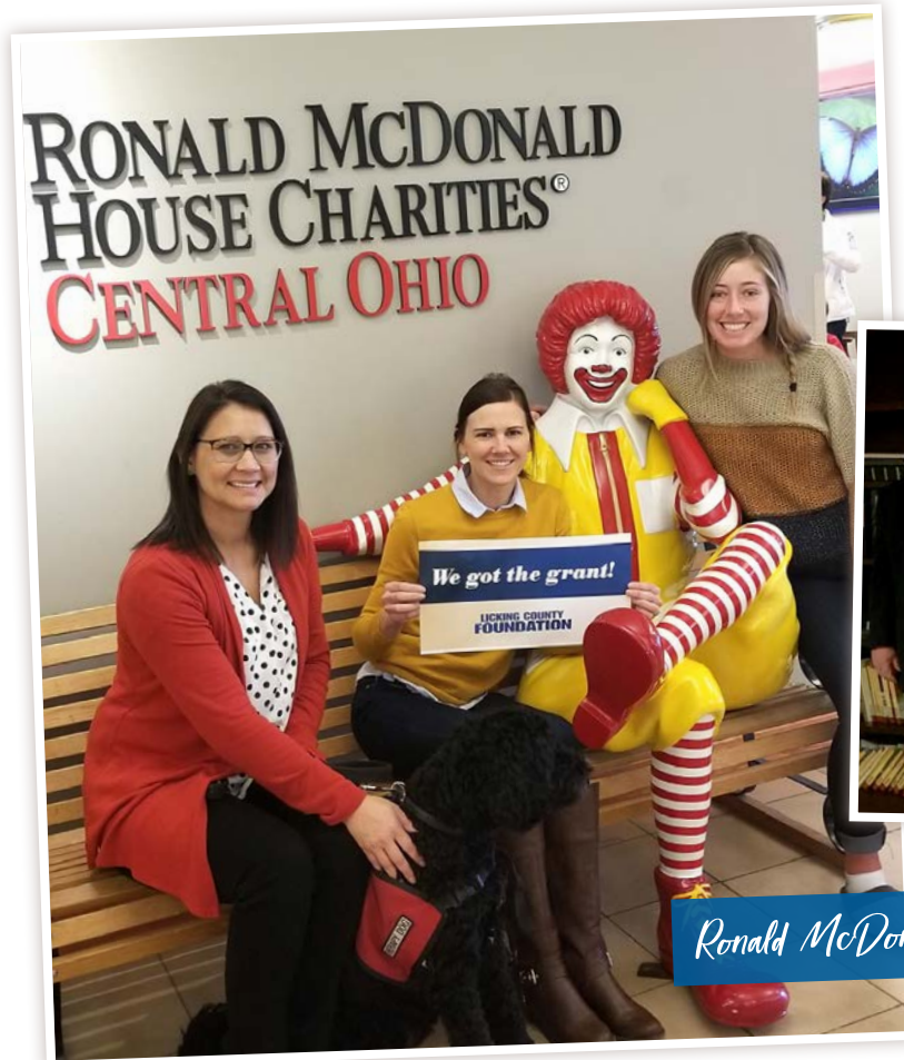
Ronald McDonald House