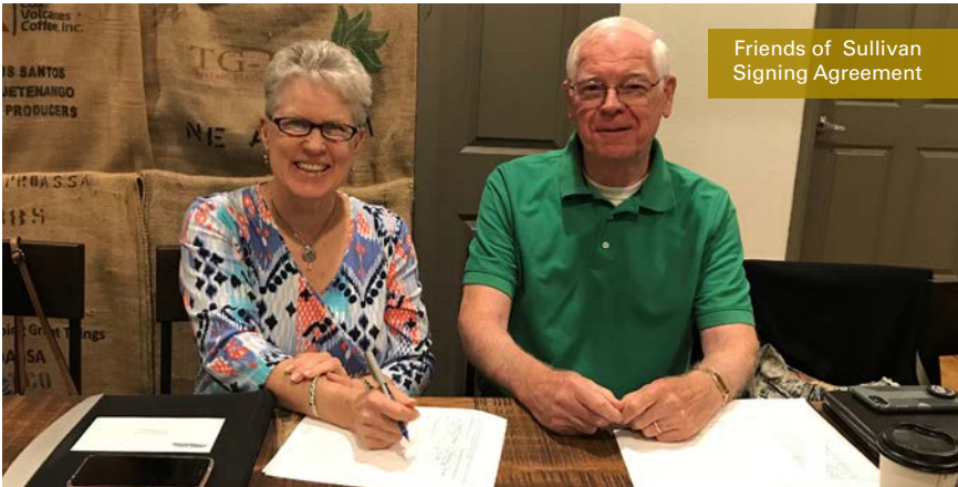
Friends of Sullivan Signing Agreement