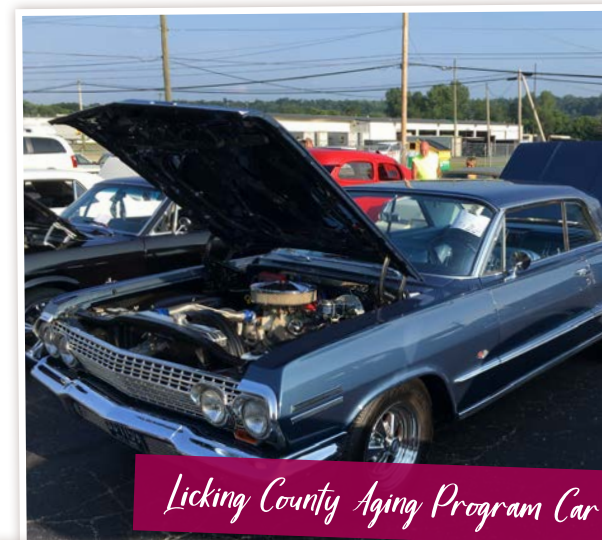
Licking County Aging Program Car Show

Wyatt Adkins Heart Organization: 2019 Night for Hearts Event