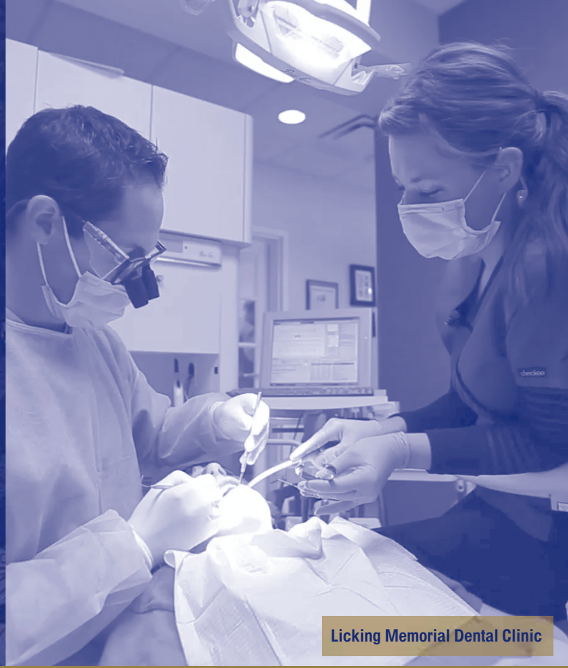
Licking Memorial Dental Clinic